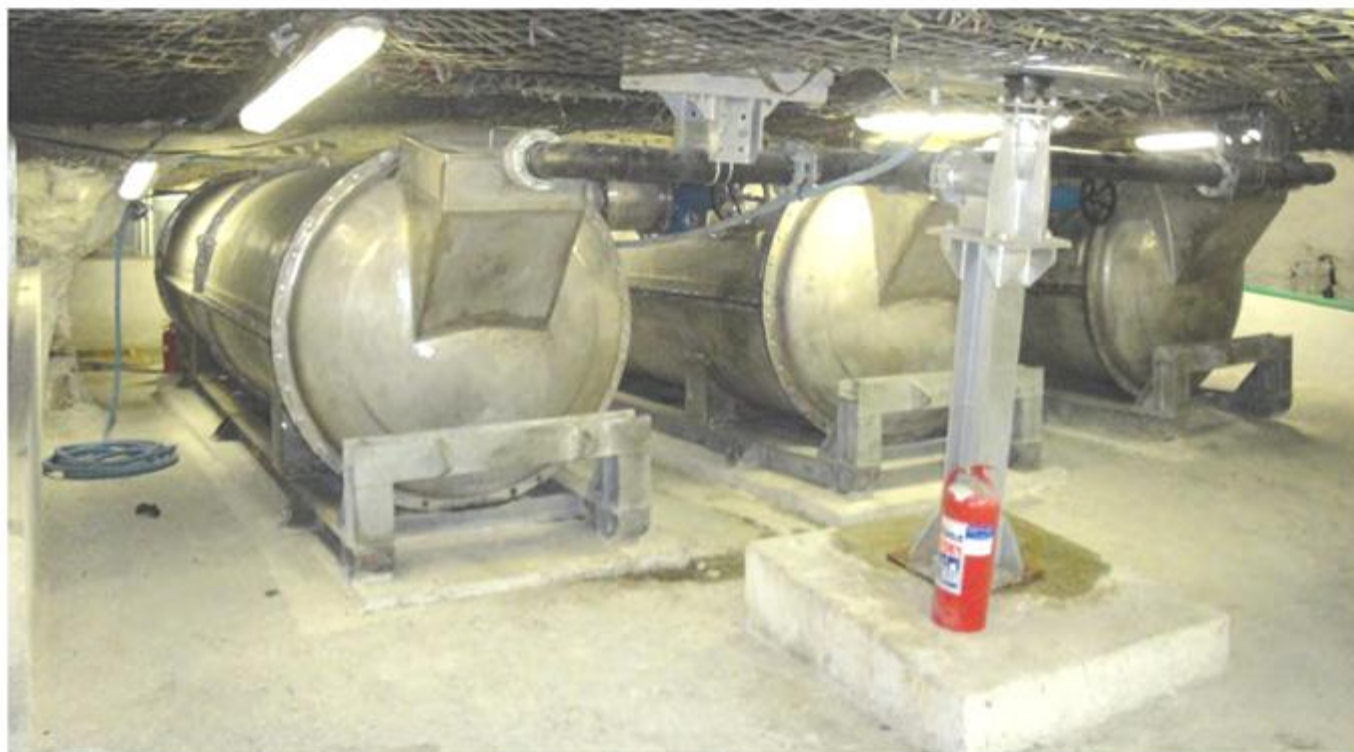
Underground storage facilities for bulk emulsion and sensitiser.

first emulsion was successfully pumped underground and the system later commissioned. RSV was appointed as the project engineer for the entire project.